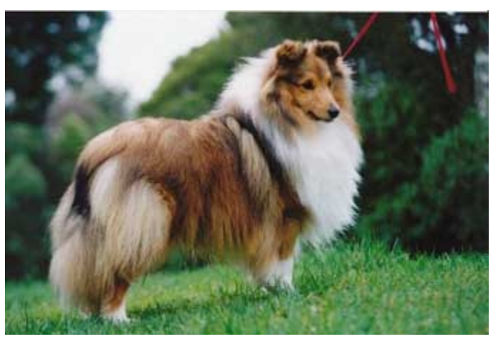
CH Eastonia Uprising.