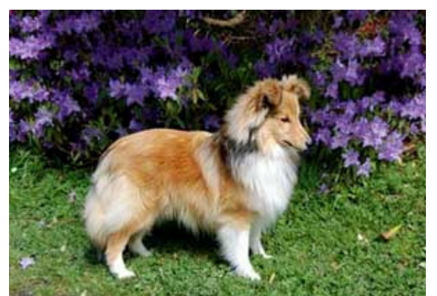
Tachnamadra The Tempest