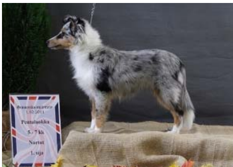
Best Bitch puppy and BOB Puppy: Arya.