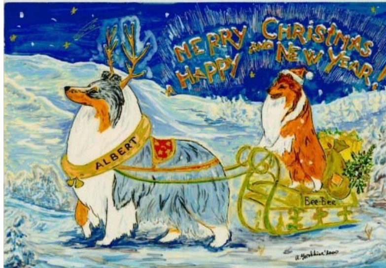
Drawing By A Yerokina. Russia