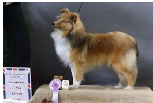
Best Dog puppy: Genitas Prince of Whitehaven.