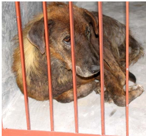
New patient with Mange Please Help!

For more information our website is at www.hartnepal.org