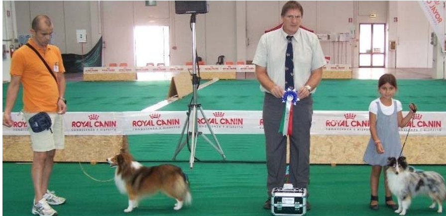
BOB - CH. GOING FOR GOLD DI SELVASPINA and BOS - ILARY MISTIK BLUE