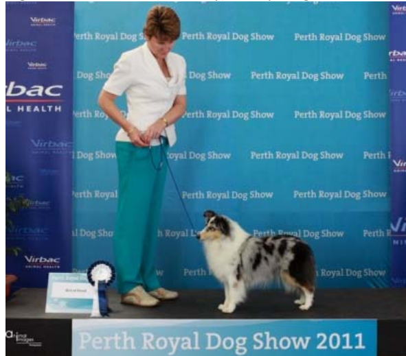
BOB CH. SUNLAND SAPPHIRE BLUE