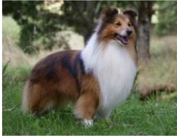
Australian Grand Champion Kelanmee Top Deck Bred, Owned and Handled by Kim Tresidder Southern Highlands, NSW Australia