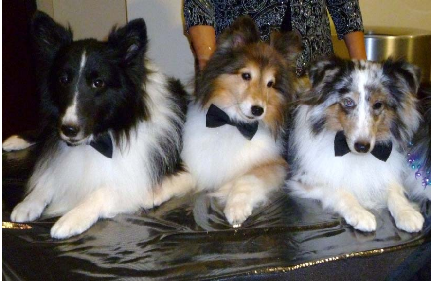
Therapy Dogs: Fred, Spenser and Jordon

Hope Hospice sponsored a Masquerade Ball last weekend and the therapy dogs went to the Ball in their formal best.