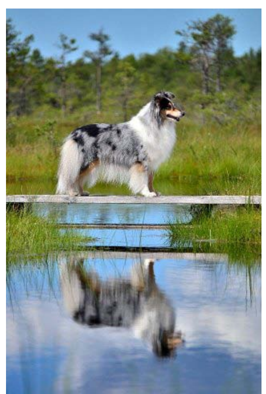
Estonia Est CH KUUKIVI PIPPIKE

Now please send your Stories, News and *Christmas Greetings* For The December Edition. <u>To be with the Editor By December 8<sup>th</sup> 2012</u>