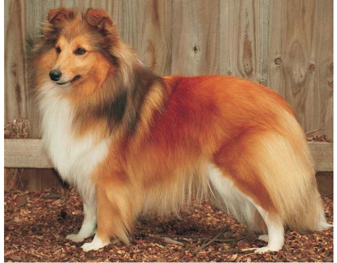
Reserve Best In Show CH. EDENMIST GOOD LUCK CHARM