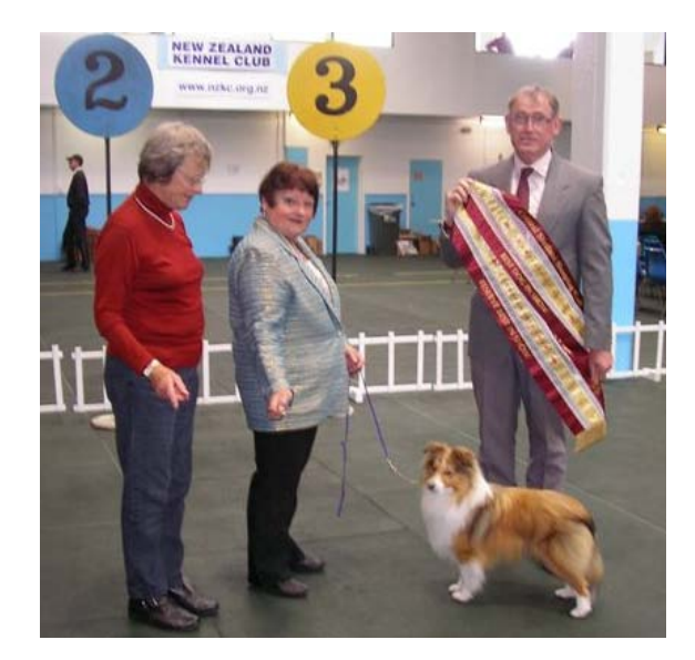
Reserve Best In Show Marsula Gambling Man imp Aus