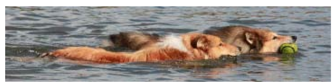
Sonic and Sing. UK