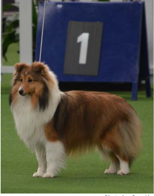
Best Of Breed: Aliste Living Doll DOB: 26/10/2011 Sire: Aust.Supreme Champ. Kencherry's Union Black Jack CD (Imp Japan) Dam: Aliste Hidden Strings Dog Challenge : Jpn Ch & Ch Kencherry's Union Black Jack Reserve : Gr Ch Nigma Cadfael Bitch Challenge : Aliste Living Doll Reserve : Ch Rimini Mustang Sally