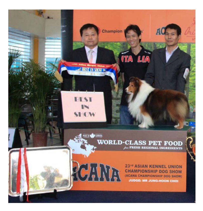
Multiple BIS/Group AM/SPORE CH Kensil's Meet Me In St Louis