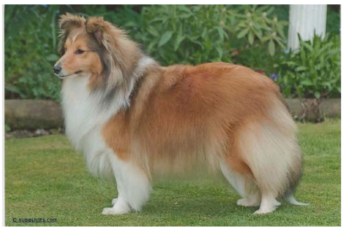
BEST IN SHOW NZ CH. NIGMA MELLIODORA (Aust.)

Championship Show 2, Judge MAURIE CHAPMAN, Melbourne