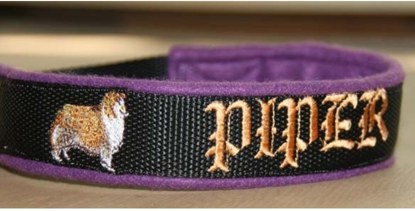
My newest design is the Sheltie/Collie and the dog name in the middle.

TWO BIG boxes arrived. I didn't know what to do with the machine, and was nearly at the point of giving up. I could see I needed to learn to use the PC program for this embroidery. After a short while, I had bought a lot of the equipment that I needed. And then I started practice.